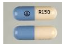
Pradaxa 150mg capsule

MAQI2 (Michigan Anticoagulation Quality Improvement Initiative)